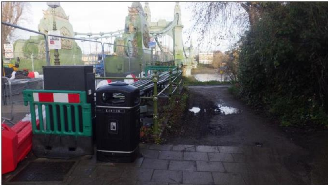
Plate 3: View of position of the southern abutment to temporary bridge (looking north) with Hammersmith Bridge in the background

The Temporary Bridge will land either side of the River Thames (River); into the London Borough of Hammersmith and Fulham (LBH&F) on the north bank, and the London Borough of Richmond upon Thames (LBRuT) on the south bank. By its very nature, the River is undeveloped, however, the southern landing area is partially hard surfaced: